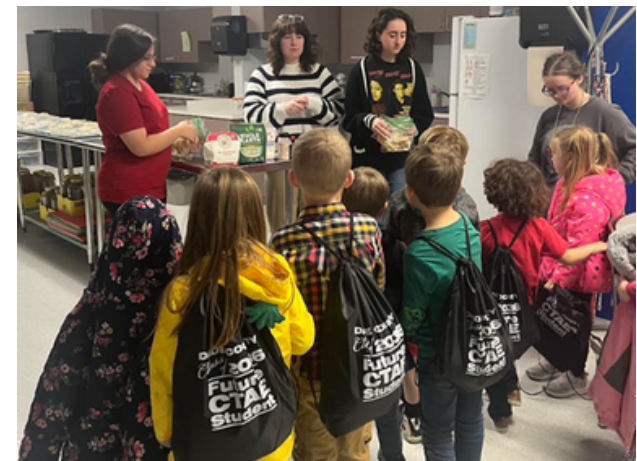
Operation Graduation 2036