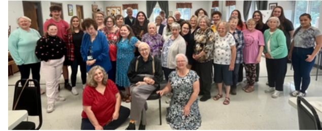
Senior Center Visit