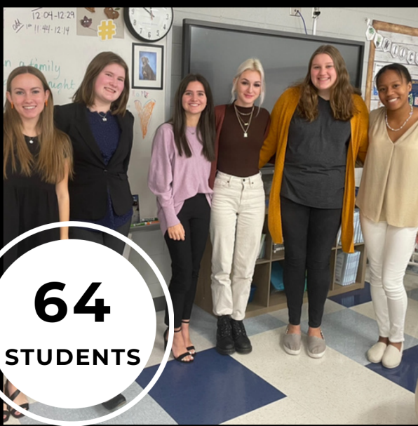
Teaching Pathway students after teaching out in their classroom for the day!